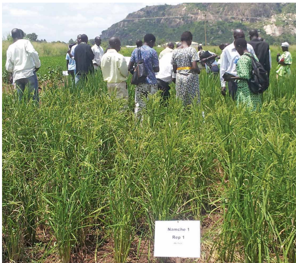
LSB farmers vote for their favorite varieties during on station field day organized by ISSD at Ngetta ZARDI

Most seed companies in Uganda - comprising the formal seed sector - are mainly interested in crops with high profit margins (higher multiplication ratios) such as hybrid maize. Self-pollinating crops, which are the major food crops, are not normally considered by the formal sector. ISSD Uganda hopes to bridge this gap by engaging farmers in seed entrepreneurship through the LSB model. ISSD Uganda is working both directly and indirectly with about 100 LSBs to produce quality seed of locally adapted crops and varieties for local markets; this seed falls under the quality declared seed (QDS) class. The LSBs fill the gap in quality seed production for crops such as beans, groundnut, simsim and sorghum, which commercial seed companies are not sufficiently involved in.