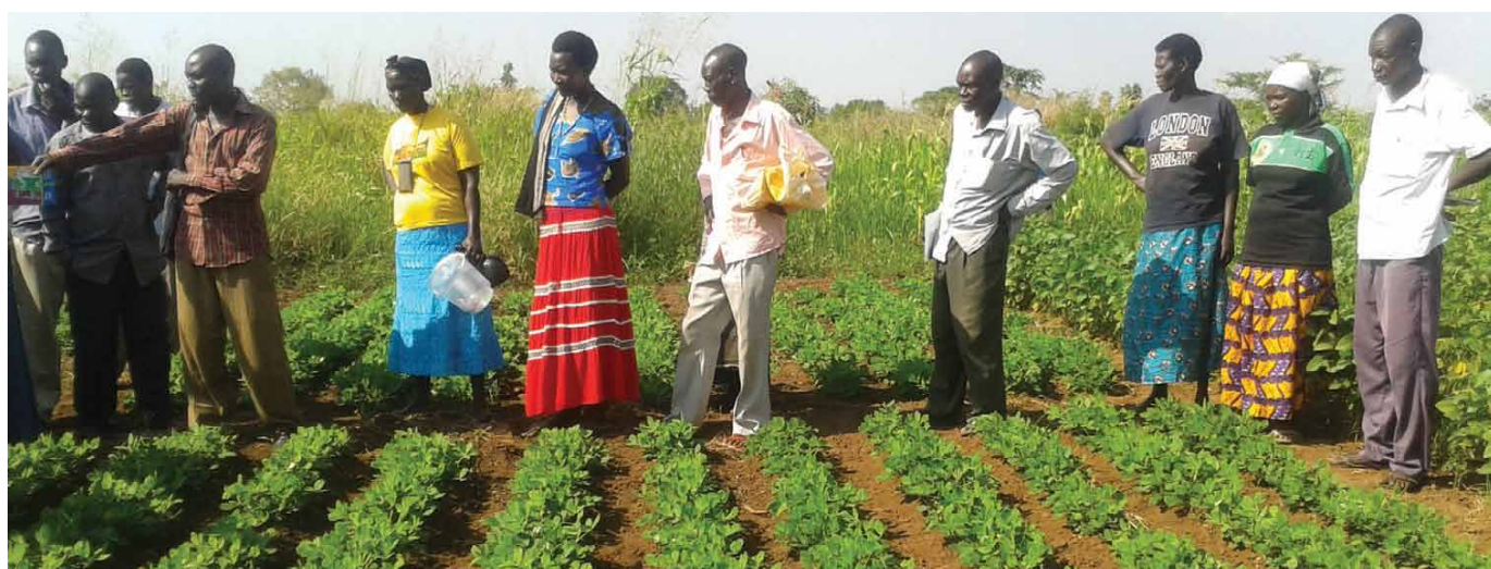
Farmers at a field day at a LSB demo garden

2 ISSD has engaged in policy dialogue that has successfully led to the recognition of QDS as a seed class under the draft 2014 seed policy, draft national seed strategy, and the national agricultural development plan 2015/16 – 2020/21.