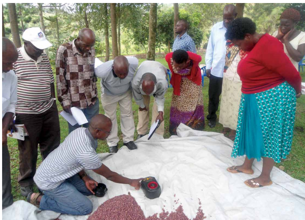
How to use a moisture meter-Kazo LSB

ISSD Uganda's experience demonstrates the informal seed sector's ability to increase the availability and variety of quality seed for desired crops to local farmers, including those located in areas where formal seed producers are not available. Since its inception, ISSD Uganda has focused its support on seed market supply with little input on seed uptake and the demand side. To maintain an equilibrium in the quality seed market, ISSD is in the process of conducting awareness campaigns on the use of quality seed (both certified and QDS) at the national and zonal level. This will bring the programme even closer to attaining its goals of: 1) increasing quantity of food produced from seed; 2) increasing farm income due to farming households using quality seed; and 3) increasing farm income of LSB members engaged in quality seed production and marketing.