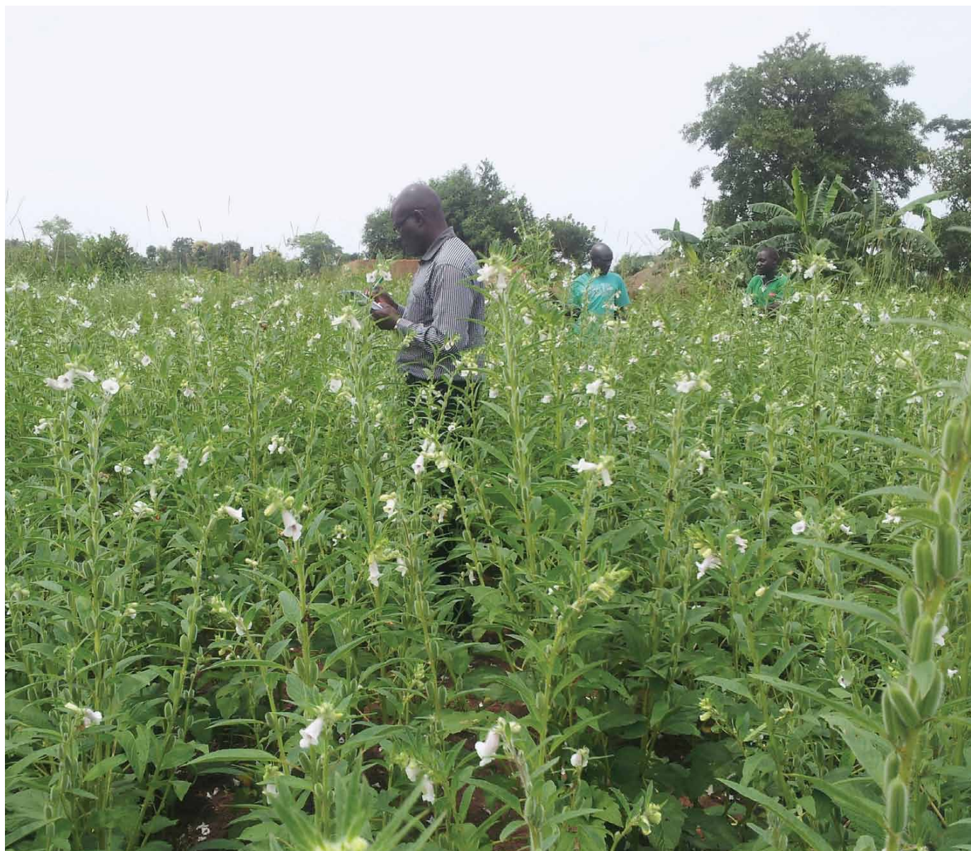
DAO Dokolo District Inspect sesame seed Field in Aye Medo Ngeca Dokolo district